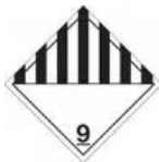
US DOT SYMBOLS