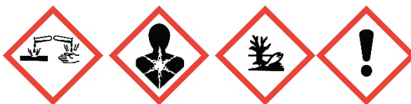
GHS HAZARD SYMBOLS